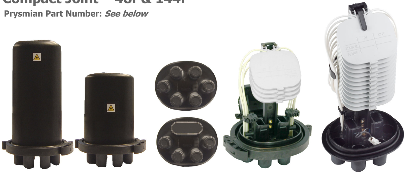
48f version shows pole mounting bracket

The OAsys Compact Joints primary application is for joining optical fibre cables together at cable element level. The joint is ideal for use as a Cable Chamber Joint, Track Joint or Spur Joint due to its capacity and compact size. It is available in two sizes, of 48 fibre and 144 fibre maximum splicing capacity. The splice trays are factory fitted and each tray can accommodate up to 12 spliced fibres. A multi-functional bracket can be supplied with the joint (aerial joint) which enables wall or pole mounting of the joint vertically or horizontally. The bracket can also be strapped to a pole using a metallic band. The joint can be supplied with a base with six circular ports or a base with an oval port and four circular ports.